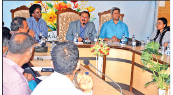
Dignitaries at National Colloquium at GDC Qazigund.

STATE TIMES NEWS QAZIGUND: In connection with World Environment Day, the Eco Club "College Green Corps" of Government Degree College (GDC) Qazigund organized a National Colloquium on "Contemporary Ecological Issues: Challenges and Strategies" in collaboration with the Ecopsychological Foundation of Literature and Environment (EFSLE) on the college campus. The event, the first-ever national-level academic programme of the institution, aimed to provide a platform for highlighting green initiatives, sustainability practices, and environmental discourse while fostering academic partnerships and actionable ecological strategies. The colloquium witnessed participation from eminent academicians across the country, including Dr. Rishikesh Kumar Singh, President, EFSLE, New Delhi; Dr. Amit Ranjan,