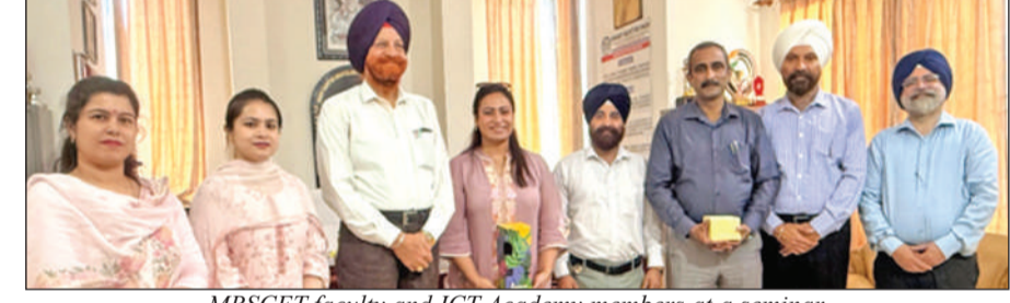
MBCSET faculty and ICT Academy members at a seminar.