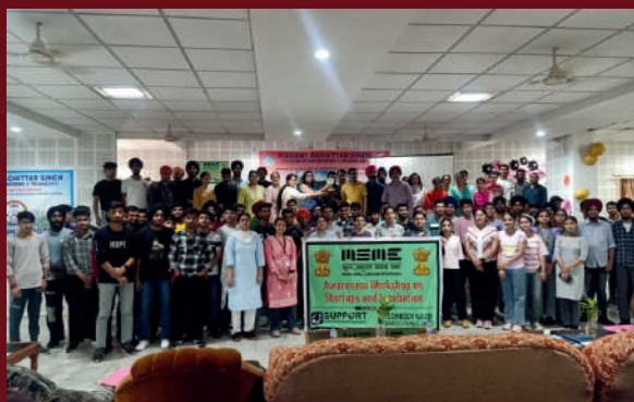
Seminar Conducted by MSME