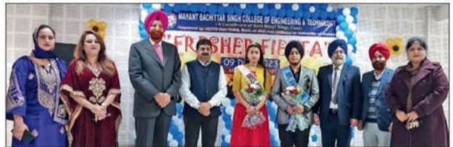
Mr. and Ms. Freshers posing with faculty members at a programme.

STATE TIMES NEWS JAMMU: Mahant Bachittar Singh (MBS) College of Engineering and Technology on Saturday organized a "Fresher's Fiesta" for the batch 2023. The event commenced with the ceremonial lighting of the lamp by the dignitaries symbolizing the auspicious beginning of the