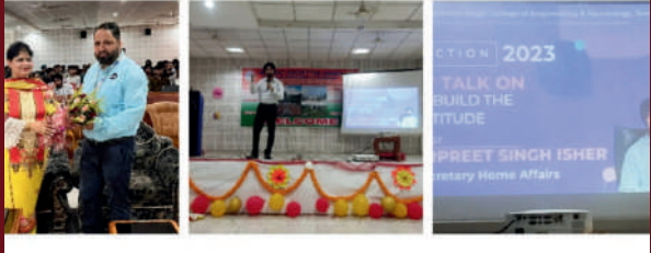
Seminar Conducted on 5G Technology.