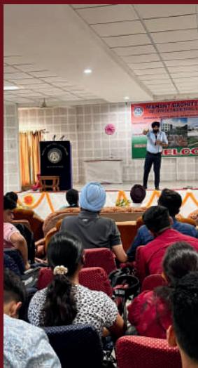
Seminar conducted by "Winnovation Education Services.