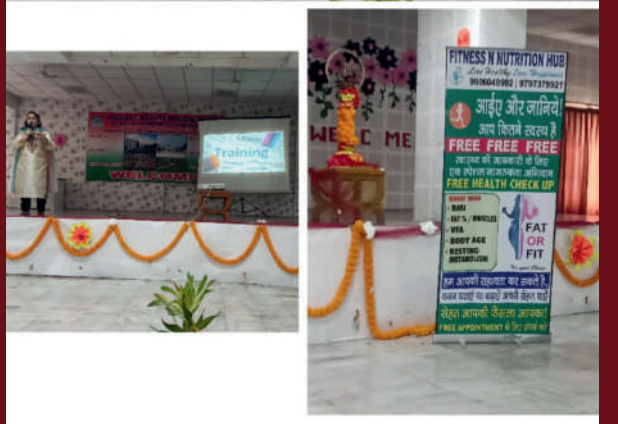
Seminar Conducted on fitness nutrition.