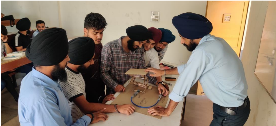
Model Based Teaching

Students are taught in labs through modern teaching aids and model based teaching.